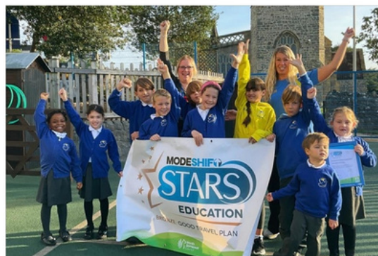
They school has upgraded a previous Bronze award.